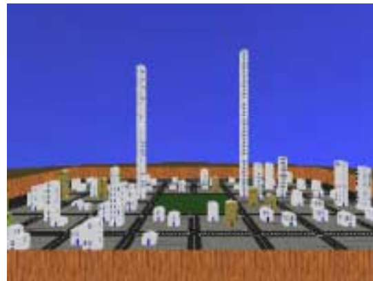
Figure 2 - Overview of entire district

In the past many of the issues surrounding software visualisation (more so than for other visualisations) have been based on the fact that all images are essentially nodes and arcs. The following issues also apply to these sorts of visualisation, but there is less scope for dealing with them. Graph layout is known to be a hard problem and layout algorithms have long been the focus of computer scientists; unfortunately focusing on mathematical properties of such rather than trying to address aesthetics and readability. To illustrate the background of some of this work Figure 3 has been included.