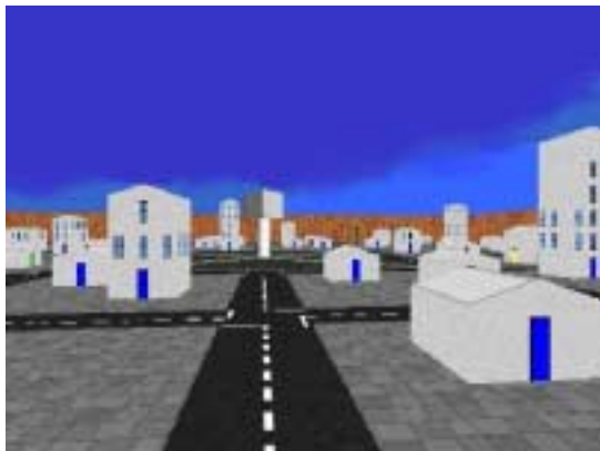
Figure 1 - District within Software World

The above literature showed that visualisation can be a good way of providing intelligence amplifying tools for the analysis and understanding of complex data sets. This is essentially what all visualisations are trying to do, although variations along the teaching/learning and statistics avenues do exist. It can also be seen in the above sections. In the work done to date on software visualisation [Knig99a, Knig99b, Knig00a, Knig00b, Knig00c] the use of 3D has also been prominent. It can be seen that 3D visualisation are inherently spatial and therefore require navigation around the virtual space as well as the interface. Metaphors are used to create tangible representations from intangible data sources. The end result – the visualisation – then acts as an intelligence-amplifying tool for the purposes of comprehension and analysis. As an example, Figures 1 and 2 show sample images from the software visualisation papers cited in this paragraph. These show different views of the results of a static analysis of over 17,000 lines of Java source code.